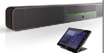
B-Series Front of the Room