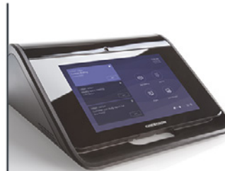
M-Series Tabletop Device