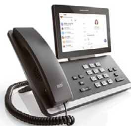
P-Series Desktop Phone