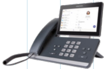
P100 / P110

Personal desk Executive offices Common areas No UC / AV integration options